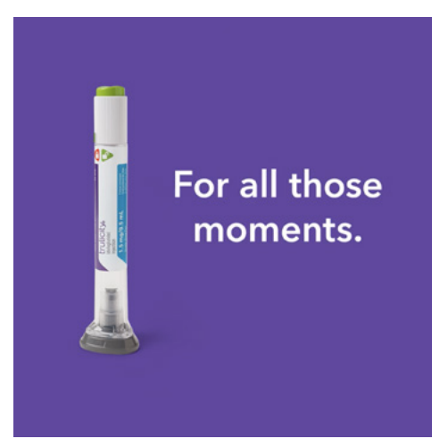
Super: For all those moments.