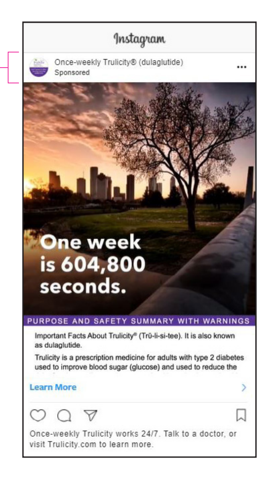
PP-DG-US-3210 07/2020 ©Lilly USA, LLC 2020. All rights reserved.