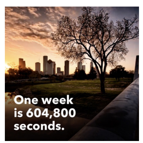
Super: One week is 604,800 seconds.