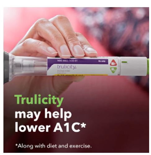
Super: Trulicity may help lower A1C*