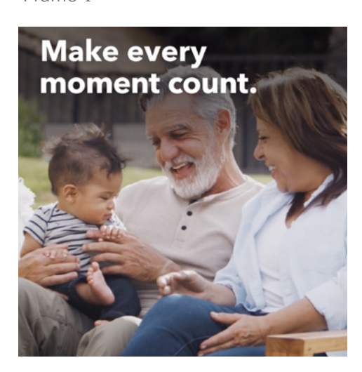
Super: Make every moment count.