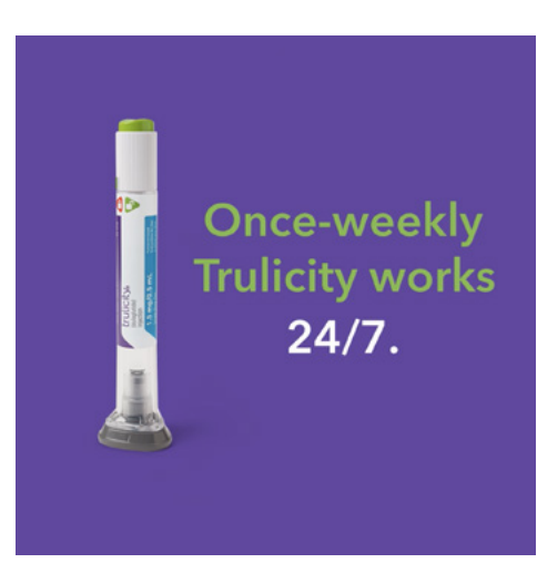
Super: Once-weekly Trulicity works 24/7.